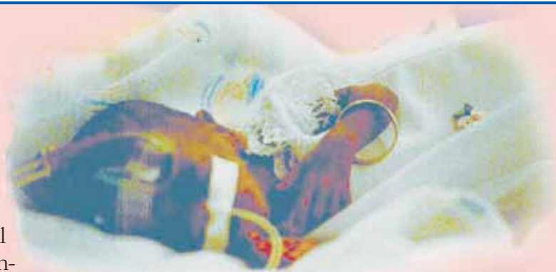
The "Dreams Come True" baby in 1986.

I called the doctor, and it was decided to change her plan of care. We put in an IV and weaned the oxygen. She became my primary baby. Needless to say, her parents and I became very close. Amazingly, she never had any complications. She became