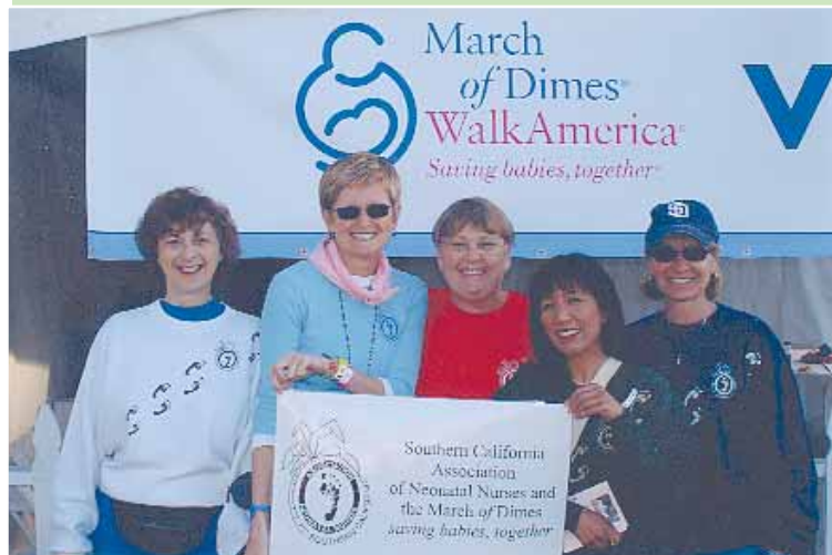
Walkers from the Southern California Association of Neonatal Nurses (SCANN) raised $2,415 for the March of Dimes. In addition, SCANN contributed $241.50 as a matching donation.

Go to www.NANN.org to see WalkAmerica photos from the Southern California and Southeast Florida NANN chapters, plus NANN’s national office staff.